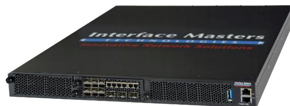
Tahoe 8840 (ISO View)