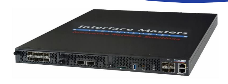
Tahoe 8724 (ISO View)