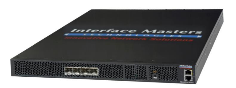
Tahoe 8830-EV (CN9880 Evaluation Unit)