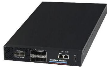
Tahoe 8522 (ISO View)

Interface Masters Technologies provides support for the LINUX distribution, Machine Learning engine, and QorIQ layerscape. Additional software and firmware enables rapid application development. Interface Masters Technologies offers level 1 and 2 support as well as software application development capabilities.