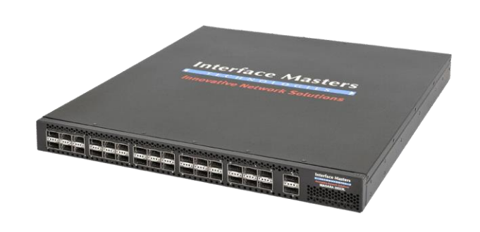
Tahoe 2932-XL ISO View